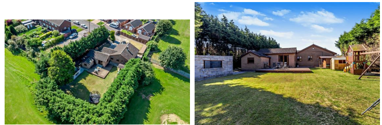
Access to the front via gated access to long driveway providing ample parking, Enclosed lawned garden to front and rear. With garden shed.