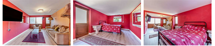
Annex with front, side and rear, UPVC windows. Radiator. Front and side UPVC doors. left access.