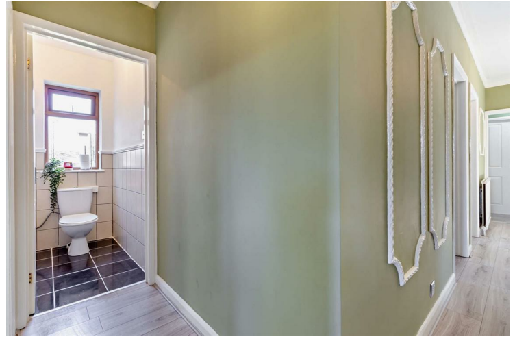
UPVC window. Tiled floor, partially tiled walls.