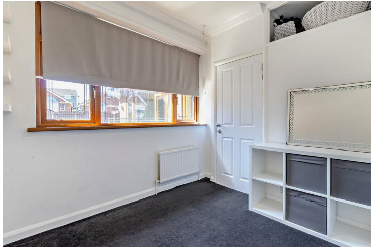
UPVC window and a radiator