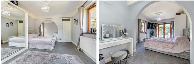
UPVC window, radiator. archway leading to dressing area, patio doors leading to rear garden